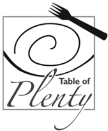
TABLE of PLENTY A Weekly Supper for the Hungry

We have a wide array of committees, faith formation groups, and service organizations that serve our parish community. More information is available in the vestibule of the church. For a complete list of groups and meeting times, visit our parish website: www.ourladyofthepillar.org/groups