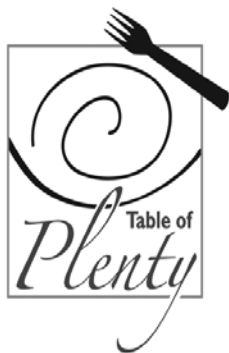
TABLE of PLENTY

We have a wide array of organizations, committees, faith formation groups, and service organizations that serve our parish community. Find information in the vestibule in the back of the church. For a complete list and meeting times, go to our parish website: www.ourladyofthepillar.org/groups