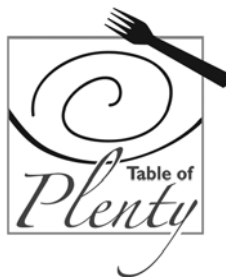
TABLE of PLENTY