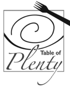
TABLE of PLENTY

The Office will be closed Thursday March 21