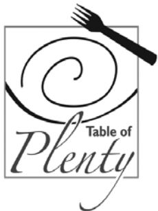
TABLE of Plenty: ...a weekly supper for the hungry