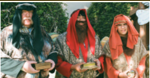
Live Nativity 2009