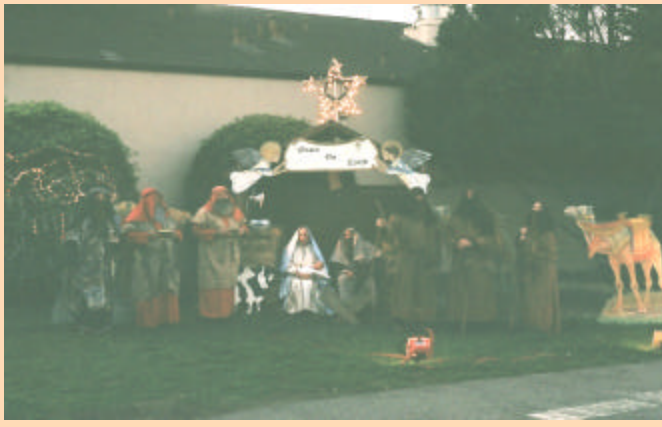
22nd Annual Live Nativity Scene